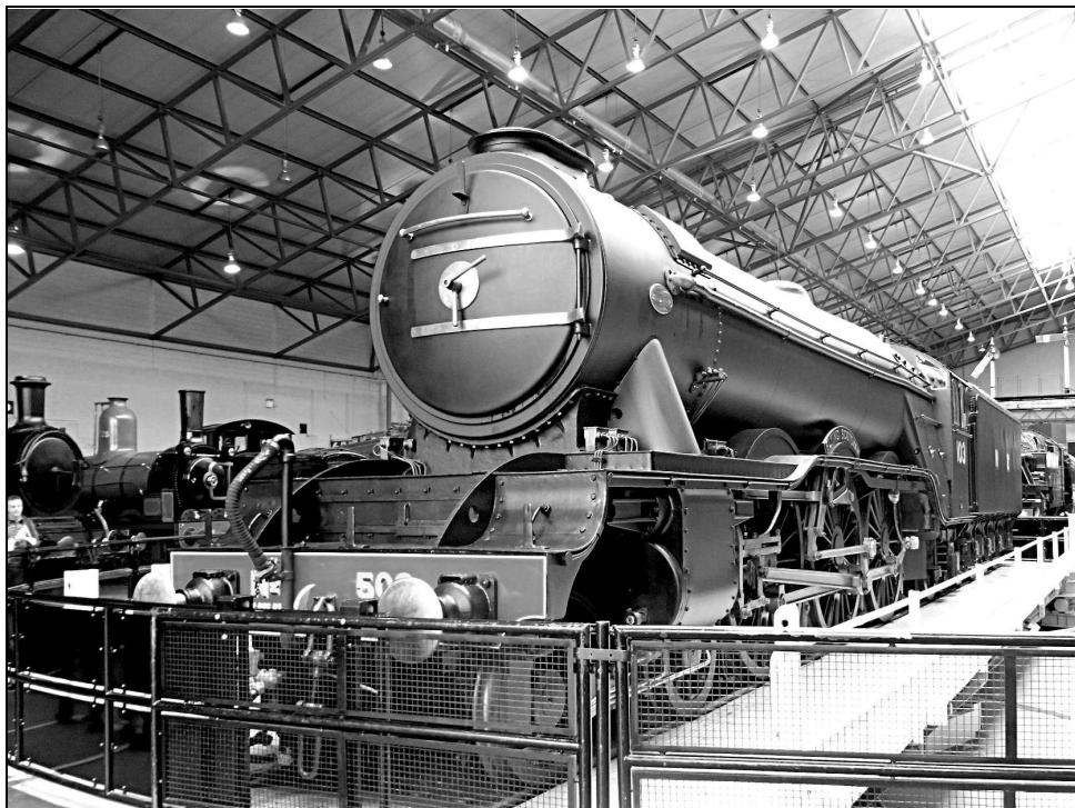
Look who's black! A3 Pacific Flying Scotsman newly overhauled in LNER wartime black and numbered 502. Photo' furnished.

We traditionally loan items and rolling stock from our collections both in recognition of the lack of display space available at NRM sites, and as an active element of outreach objectives. If one considers the NRM to be as much a national and international concept as it is a fixed geographical location then it is in our continuing interest to