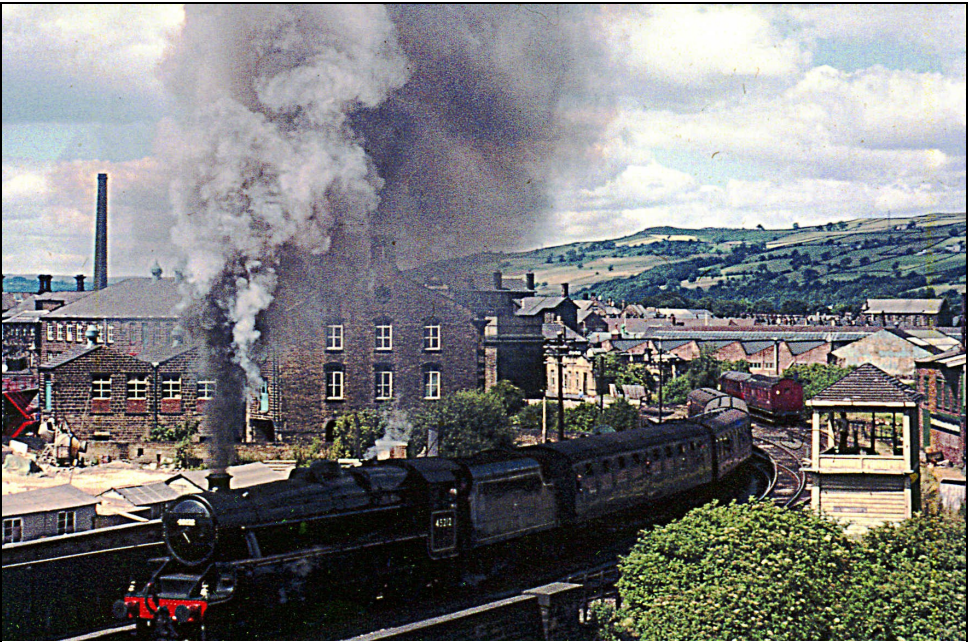
5MT 45212 making sure everybody knows how steep the gradient is on the 14:35 Keighley to Oxenhope leaving Keighley on 7 July 1971. (page 3).

Below: Princess Coronation class 6229 Duchess of Hamilton was returned to its streamlined form in 2009 and is on display at the National Railway Museum, York. (page 5).