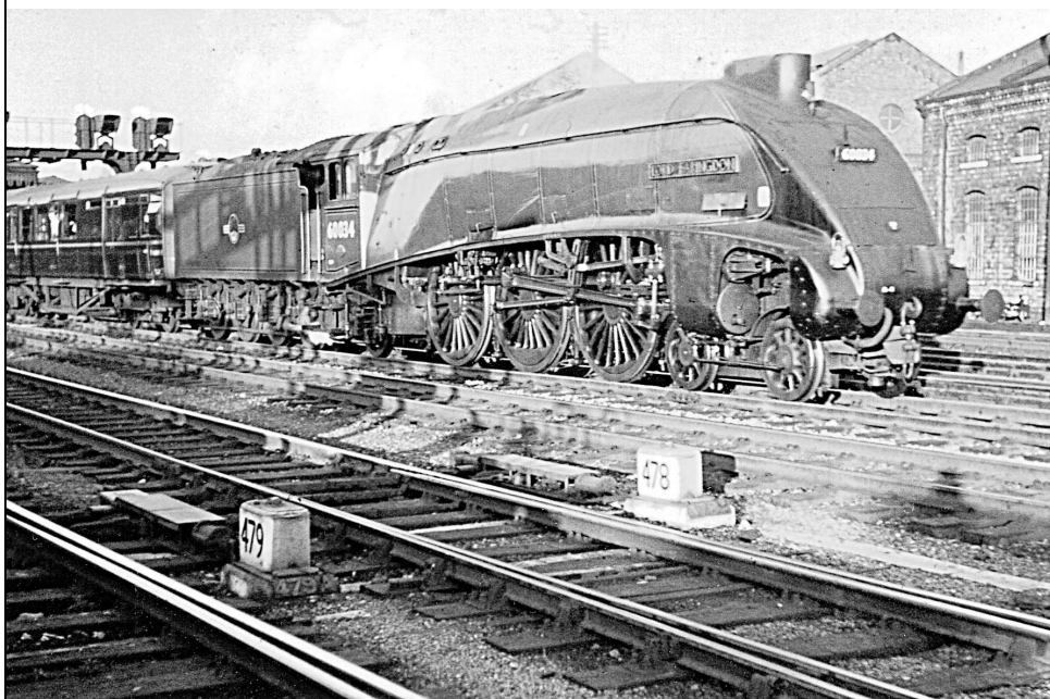
A4 60034 Lord Faringdon, on an up express at York.